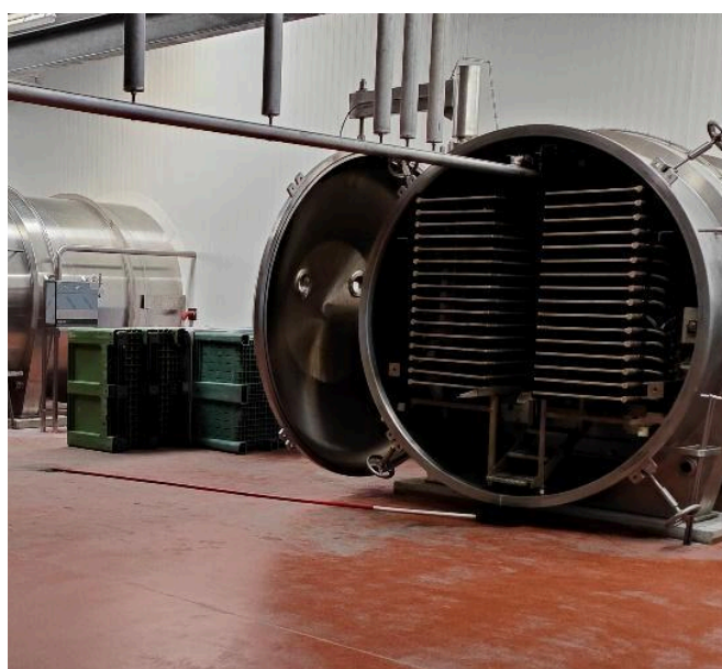
One of Natures Menu's freeze drying machines

Once the material is sufficiently dried, it is sealed in moisture resistant packaging to prevent reabsorption of moisture from the surrounding environment. Natures Menu test our freeze dried products to ensure the moisture content is \leq 6\% .