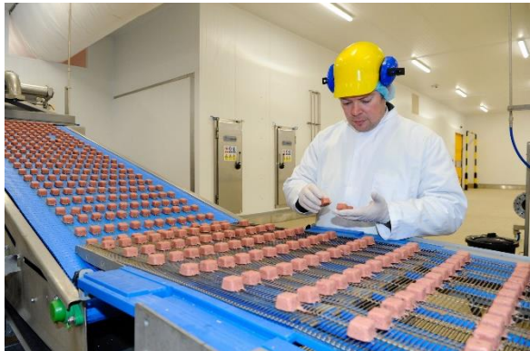
Product is formed into final shape