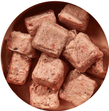
Product is frozen and packaged ready for dispatch

When producing frozen pet foods there is another added consideration to help ensure safety and that is within its distribution. It is imperative the food is not allowed to defrost and then re-freeze as this can allow micro-organisms within the food to multiply and cause the food to spoil. Therefore frozen pet food companies should take reasonable steps to guarantee this will not happen, ideally delivery in temperature controlled vehicles.